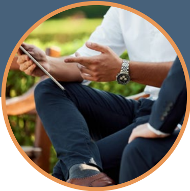
International staffing solutions

AURA is the first and only Global Security response network. This will be offered to all verticals which require a global safety solution: