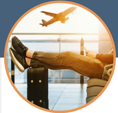
Global Travel safety