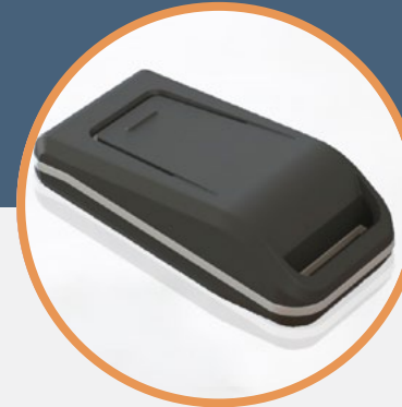
IOT - and connected car