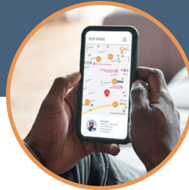
Global consumer apps and safety apps