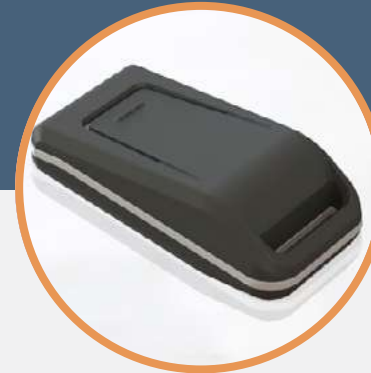
IOT - and connected car