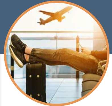
Global Travel safety